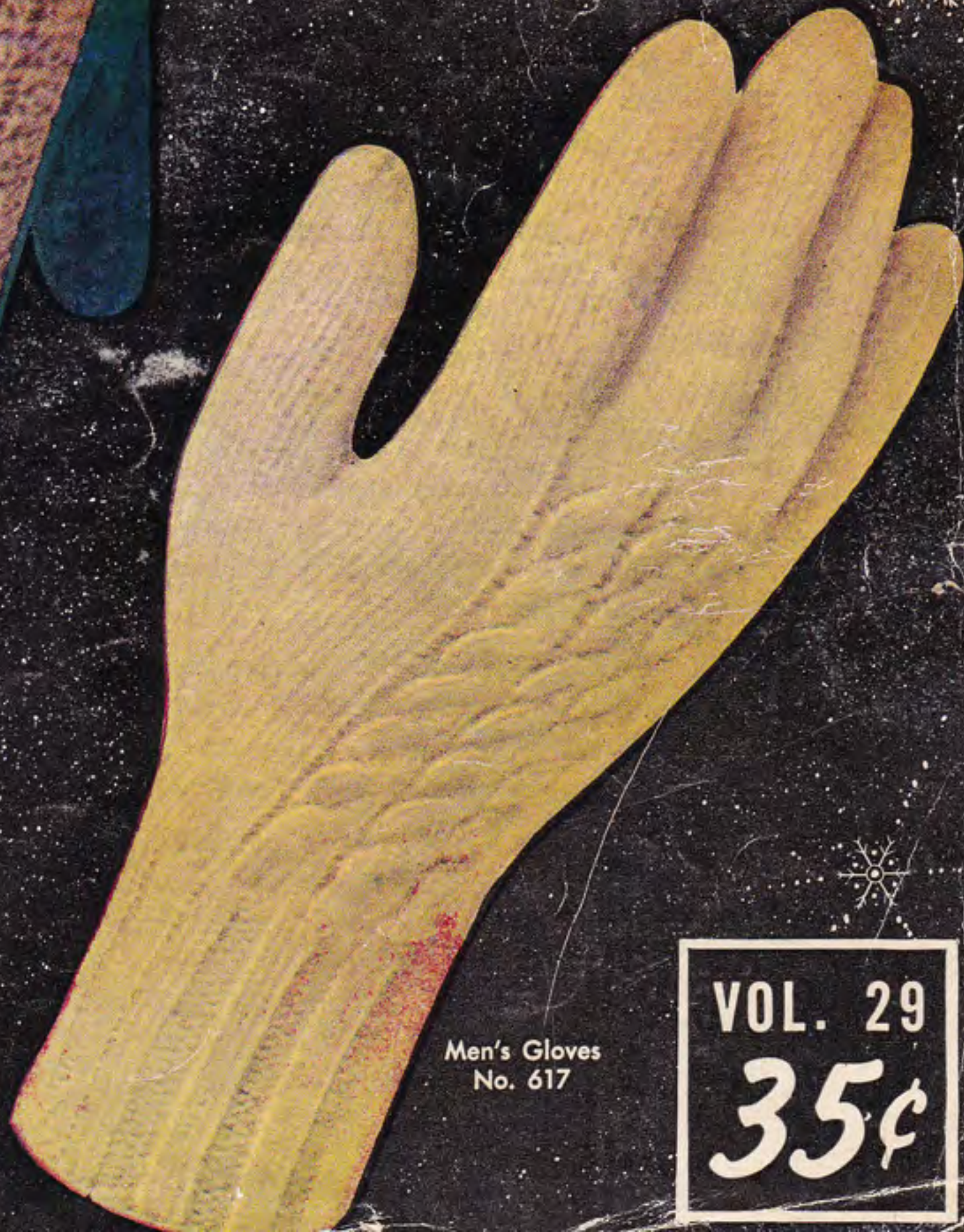
Men's Gloves No. 617