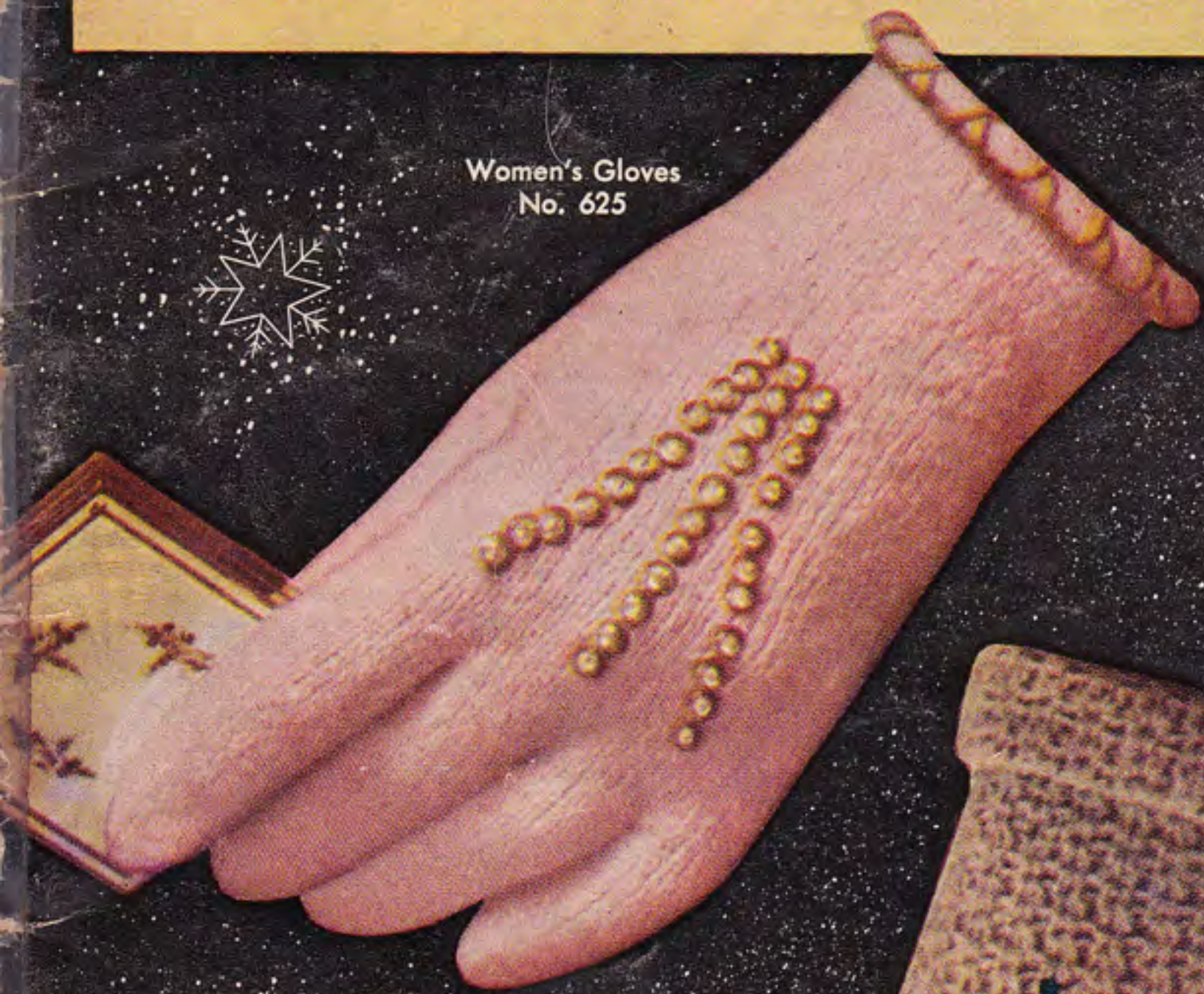
Women's Gloves No. 625